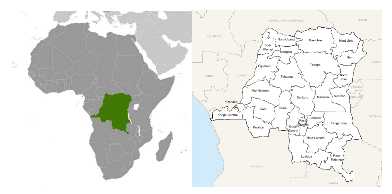
Figure 2. Institutional context—The Democratic Republic of Congo and its provinces

Notes. Infant mortality rate is measured by the number of deaths of infants under one-year old per 1,000 births alive. Source: United Nations Inter-Agency Group for Child Mortality Estimation (<u>https://childmortality.org/data</u>).