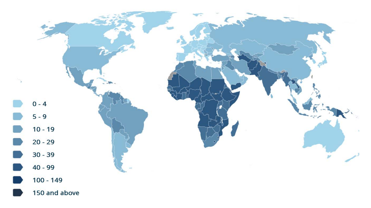
Figure 1. Infant mortality rate

Notes. Infant mortality rate is measured by the number of deaths of infants under one-year old per 1,000 births alive. Source: United Nations Inter-Agency Group for Child Mortality Estimation (<u>https://childmortality.org/data</u>).