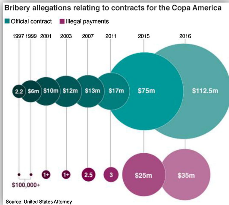
Fig. 2 Bribery in the Copa América

football officials to receive official support from these officials and acquire exclusive partnership contracts related to the football championship of South America. The bribery payments for each tournament finally reached as high as $35 million. 127 The extent of this bribery scheme, as one of approximately 15 criminal schemes sanctioned by the US authorities, is illustrated in Fig. 2 (The original source is the United States Attorney, the figure was found in Sargeant P, June 2015. Football Corruption: Who Bought the Copa America? BBC. http://www.bbc.com/news/world-latin-america-33087370 . Accessed 26 Jan 2018) below. 128